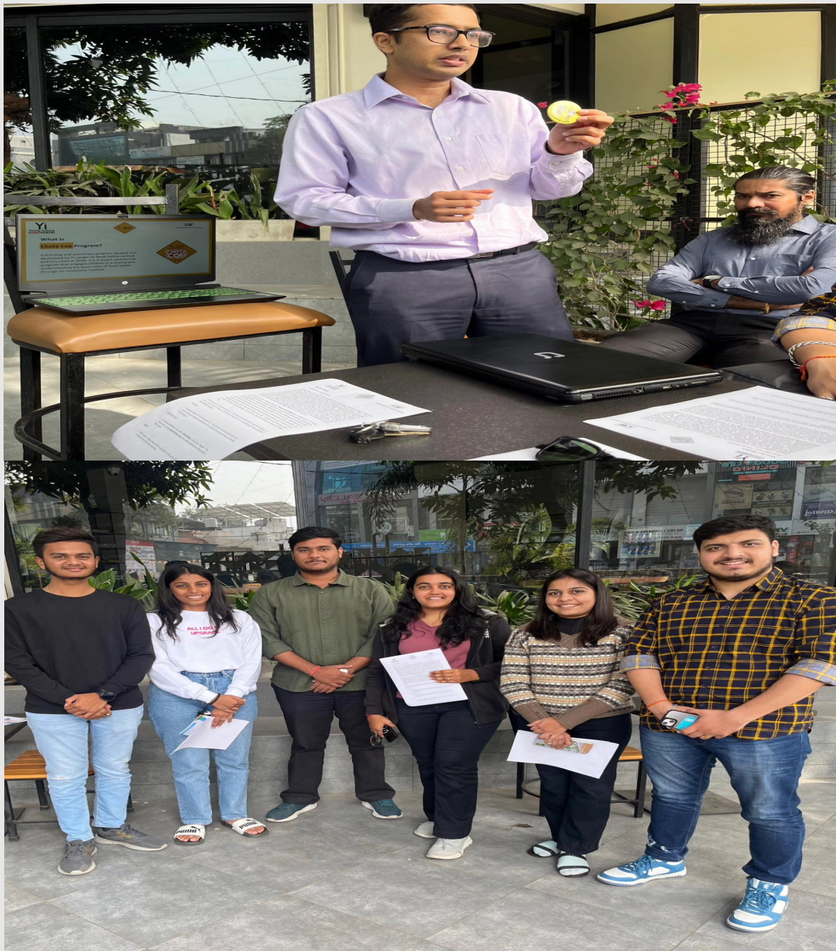
Spreading Compassion through Social Responsive Club Initiative

MBA students from CKSVIM actively took part in a road safety meeting organized by CII-YI, aimed at promoting awareness and understanding of road safety regulations among participants. Their involvement reflects CKSVIM's commitment to social responsibility and encourages students to engage in meaningful initiatives that contribute to community well-being and public safety.